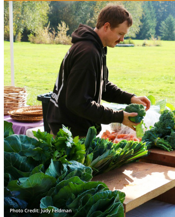
Organic Farm School student preparing their weekly farm stand.

Enjoy local food grown and raised right here on Whidbey Island